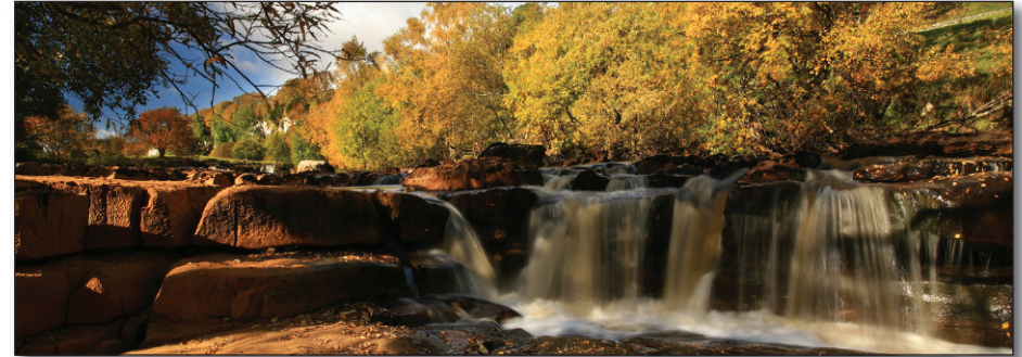
Wain Wath Force on the River Swale in autumn. The leaves turn golden and the warm afternoon sun bathes the limestone steps.