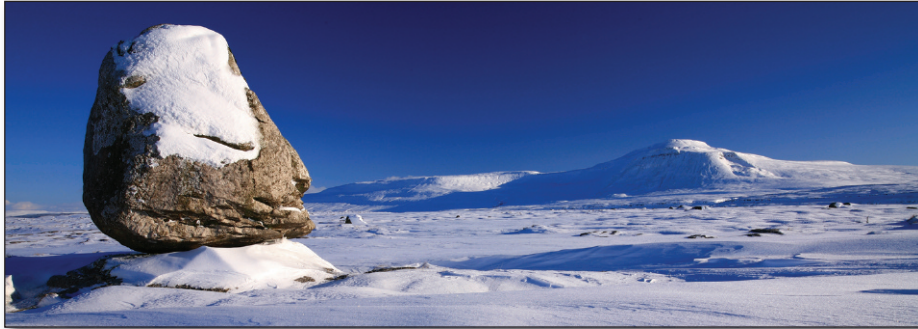
High above Chapel le Dale this spectacular limestone erratic on Scales Moor looks on towards Ingleborough.