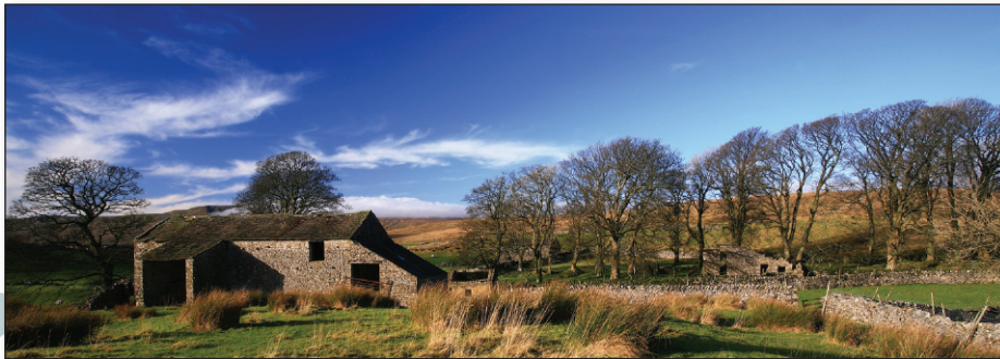
Thorns. This now abandoned hamlet was once an important resting place on the pack horse trail. Nan Bottom Lane ran through this former monastic lodge for Furness Abbey. Now little remains except traces of buildings and a barn.