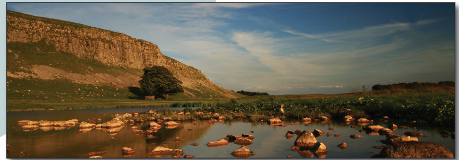
Malham Tarn with Great Close Scar in evening sunshine.