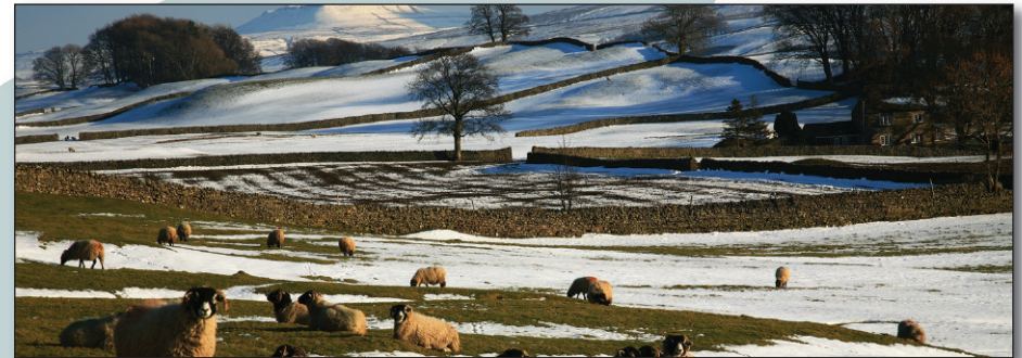
Adelborough overlooks Wensleydale in winter.